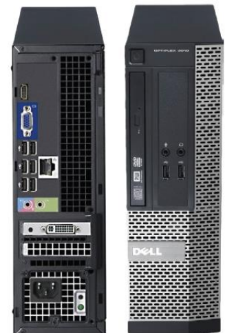
PC, keyboard, & mouse not provided with MediaWall V configurations

Combining interactive features with an intuitive interface, VIEW Controllers offer an affordable yet highly integrated information management solution for RGB Spectrum's video wall processors and switchers.